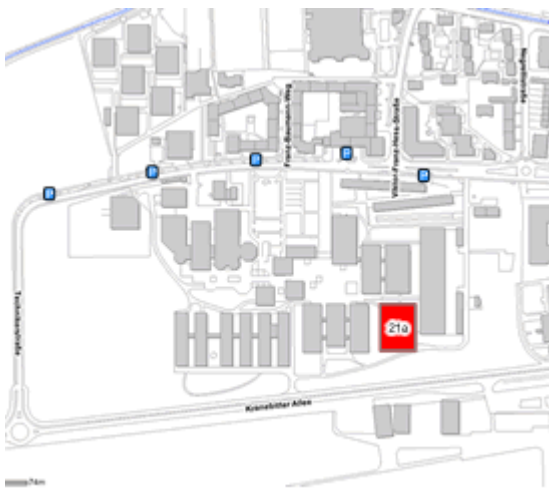
University Innsbruck Campus "Technik"